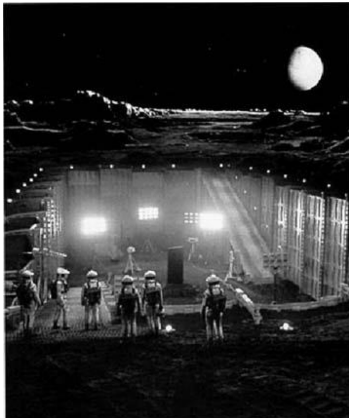
A Space Odyssey - 2001

This debate will only be resolved when we find life outside earth's boundaries and compare its basic structure to our earthly DNA. Or we find this: